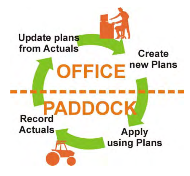
Figure 1. Plan Centric Concept

described as plan centric as the whole growing season is centred around a plan for the field. This plan will detail such activities as, the crop type and variety, seeding and fertiliser rate, insecticide and herbicide treatments throughout the growing season. The planning stage will commence in the farm office when a decision is made as to which crop is planted in the field. This decision will be made based upon historical records for the field. The plan centric concept is illustrated in Figure 1.