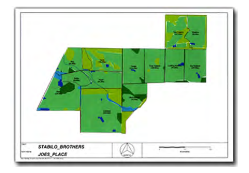
Figure 2. Sample Farm Map

Furthermore the use of the farm map provides a simple interface when developing an application plan for the farm. Recognition of individual fields displayed on a map is far easier than a tabular list of field names. Hence when selecting fields for inclusion in a plan the farm map is more instinctive to the human operator.