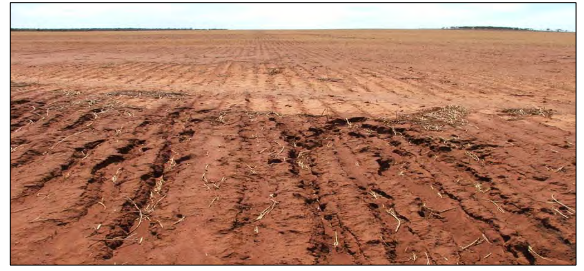
Figure 2. Riverside site after 46 mm in 30 min. rainfall event in December 2006

Further simulation work, using similar rainfall intensity, was undertaken at all of the five sites in May 2007 – similar results were observed with the effects of further reduced cover levels producing increased run-off rates across all sites.